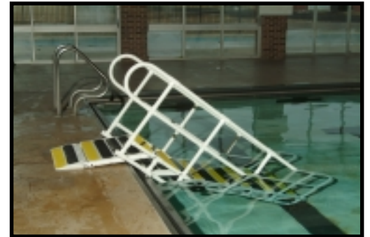
Above: The AquaTrek Step

AquaTrek Ramp available in standard or long.