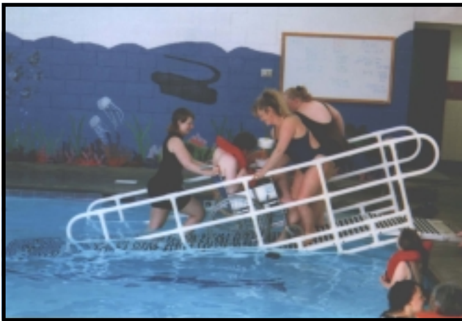
Above: The AquaTrek Ramp

AquaTrek Ladder and Step models vary depending on pool depth and desired riser height (distance between steps).